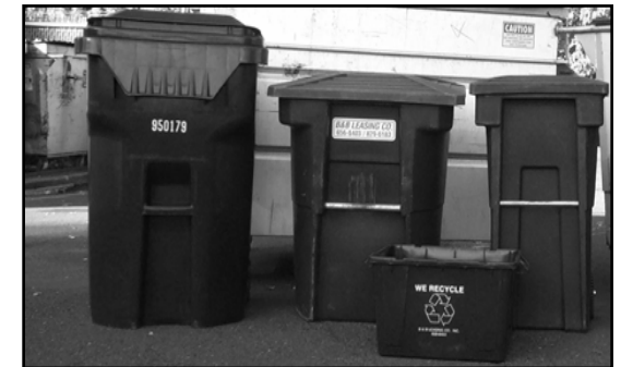
Roll Carts come in 20- 35- 60- or 90-Gallons

All shredded paper and Styrofoam peanuts must put in a garbage bag before going into your cart/can, as these materials can cause environmental problems if they are loose. Close and securely tie any plastic bags before you them put in.